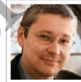
GREG MANKIW UNITED STATES

I am a professor of economics at Harvard University, where I teach